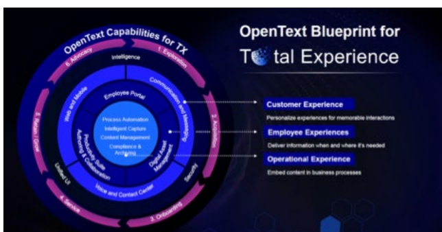
Figure 2. The OpenText blueprint for total experience

Total Experience is enabled by automation, content, digital experience, data and analytics technologies. These mutually beneficial technologies help uncover opportunities and remove effort to transform shared experiences.