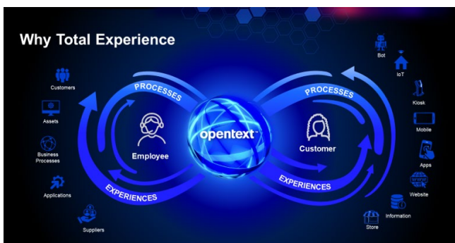
Figure 1. The OpenText vision for total experience